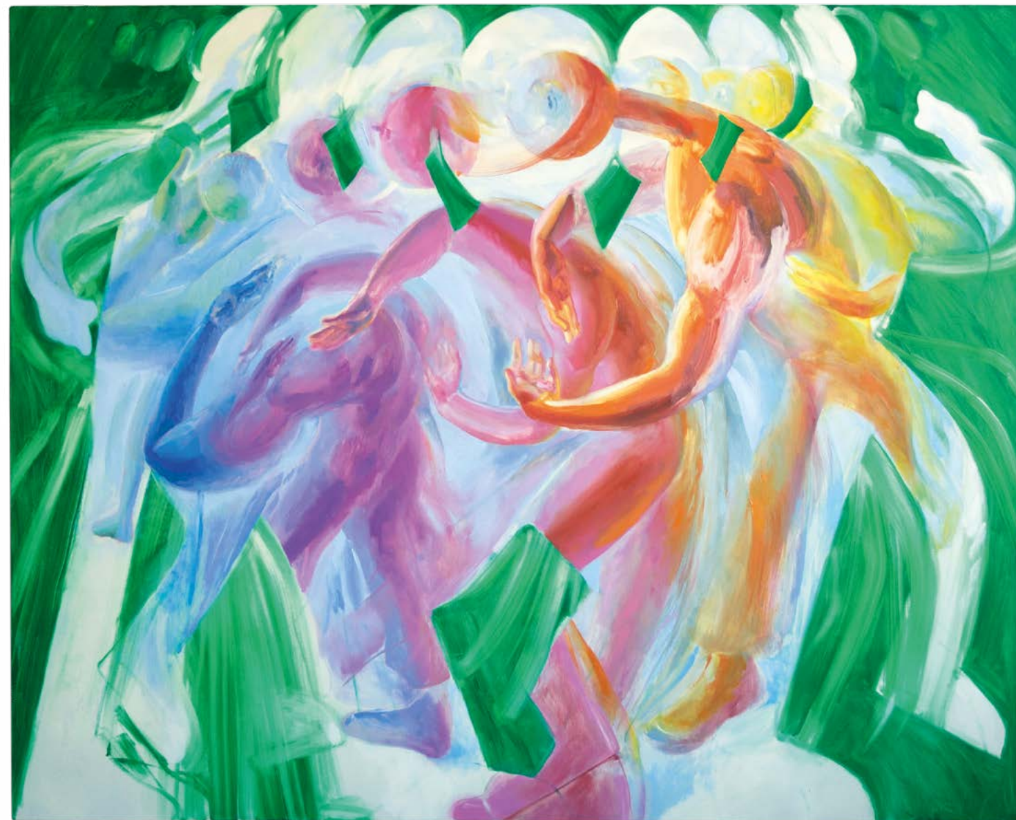
Developer, 2021