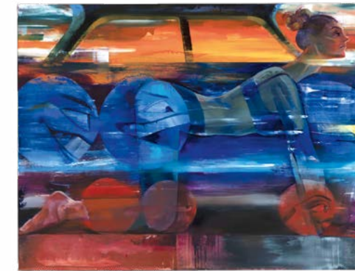
Cycle Goddess, 2022