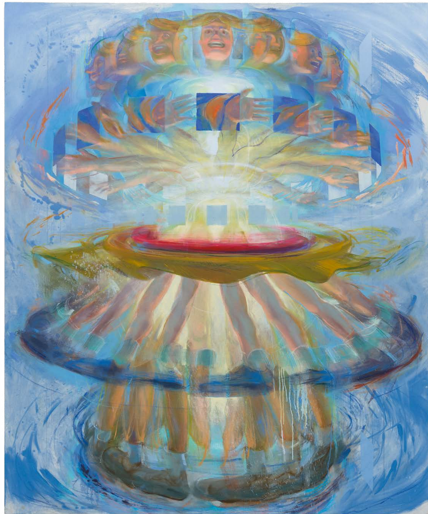
Lazy Susan, 2022